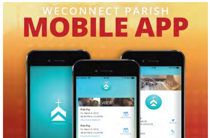
Developed for iPhone/iPad and Android

Siga las lecturas diarias de su casa o durante la misa.