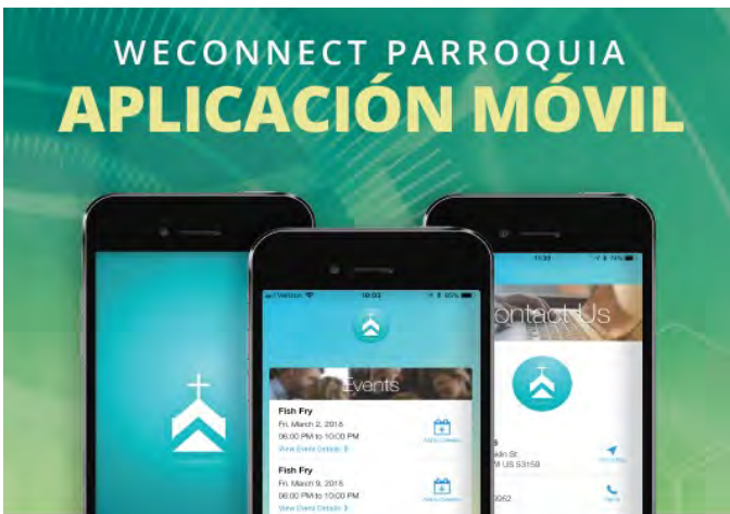
Creado para usuarios de iPhone/iPad y Android

If you have any questions, please contact the Pastoral Office at 772-287-2727, ext. 106.